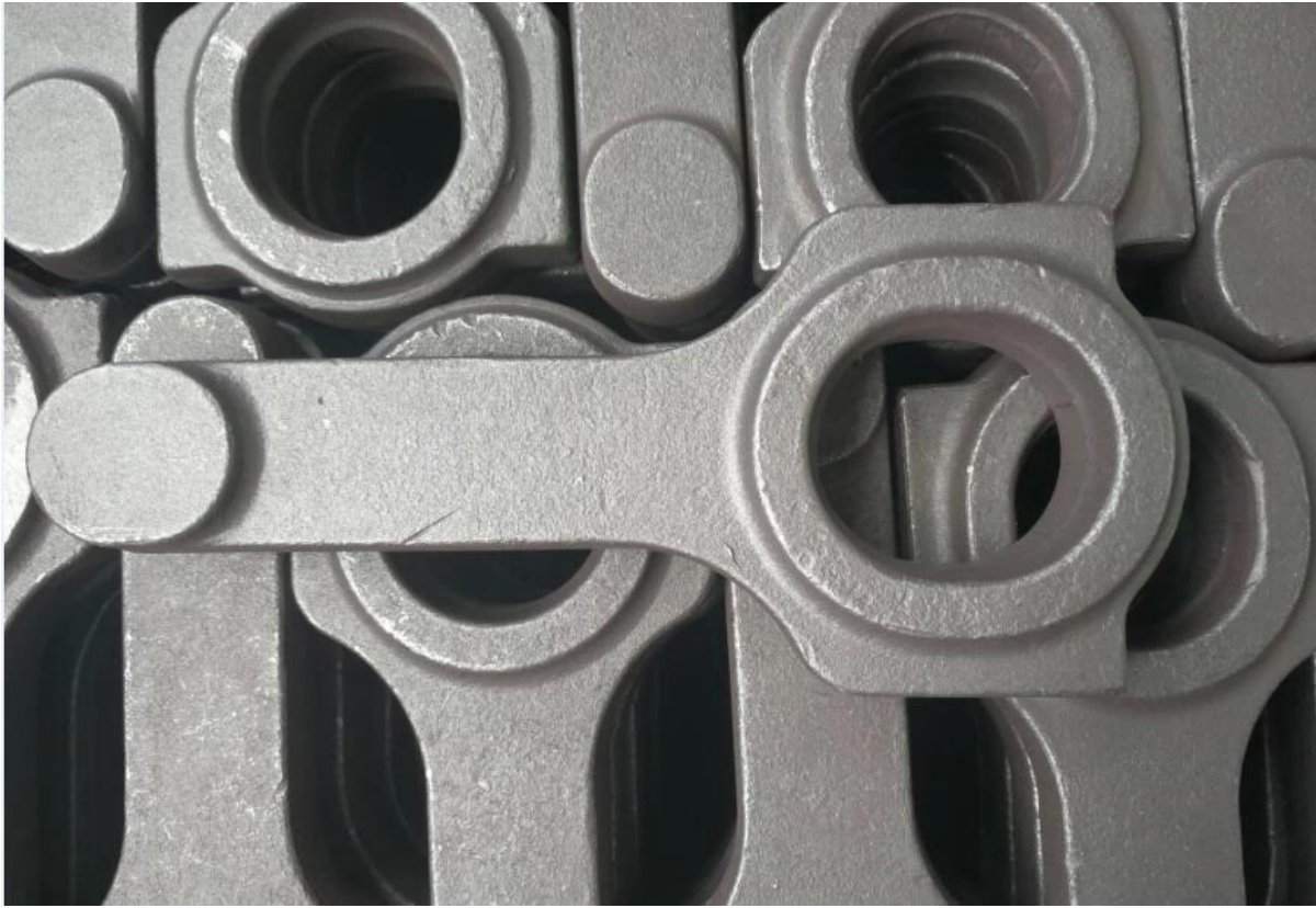
2. Honed bid end bore and small end bore with bushing