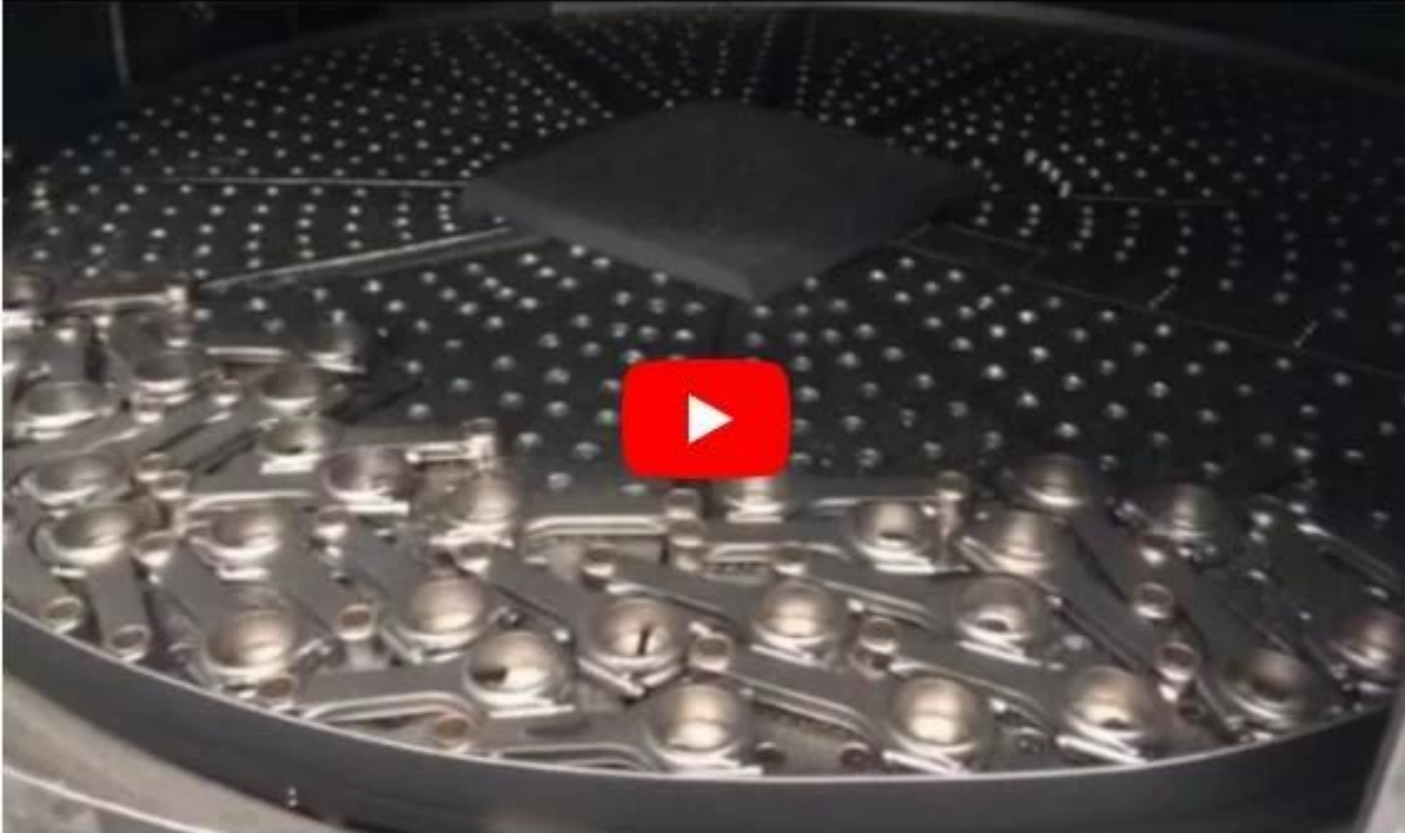
Hurricane factory workshop