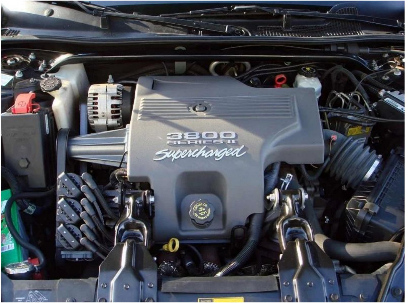
Note: Picture from Curbside Classics.