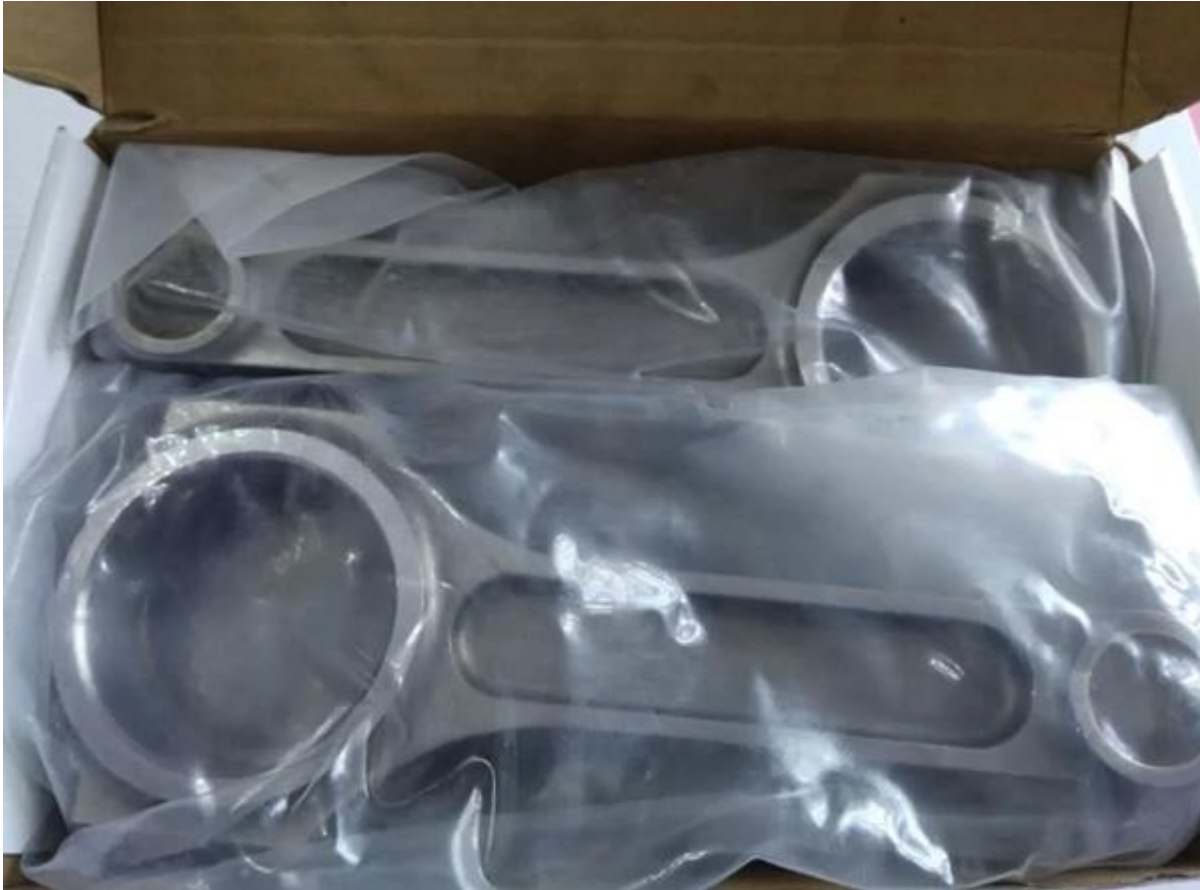
Connecting Rods Production Process