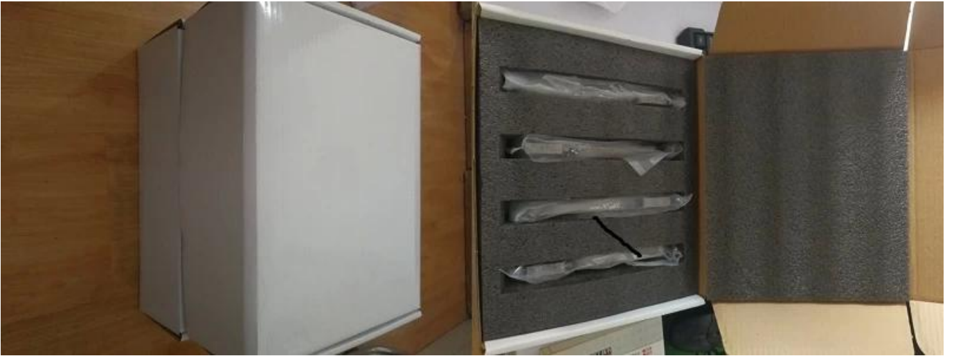
B: Neutral package