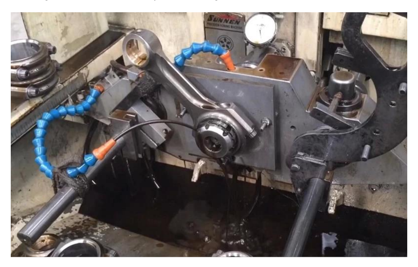
#4, Dimensionally Inspected and End-to-end balanced in sets +/- 1g

#3, All big and small ends are honed by SUNNEN honing machine.