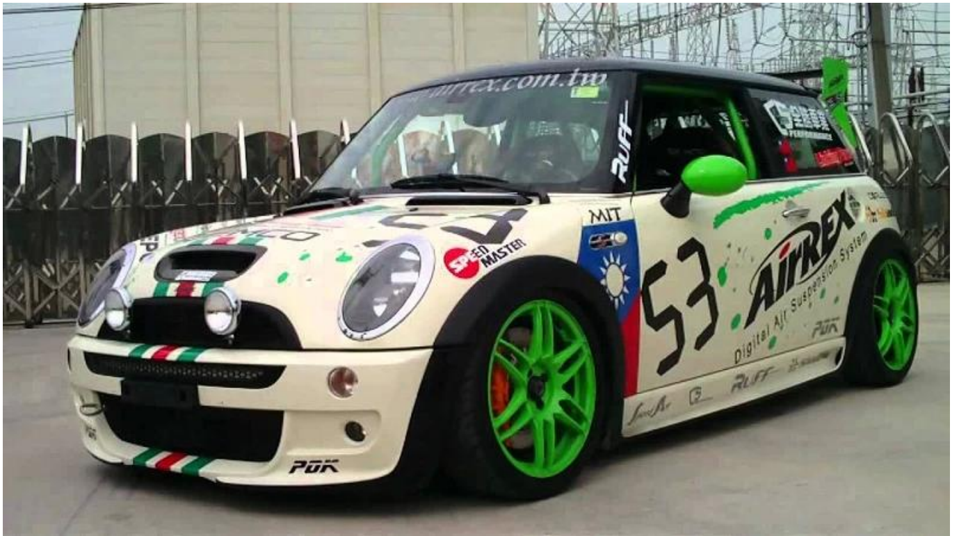
Note: Picture from Youtube(airrex008)