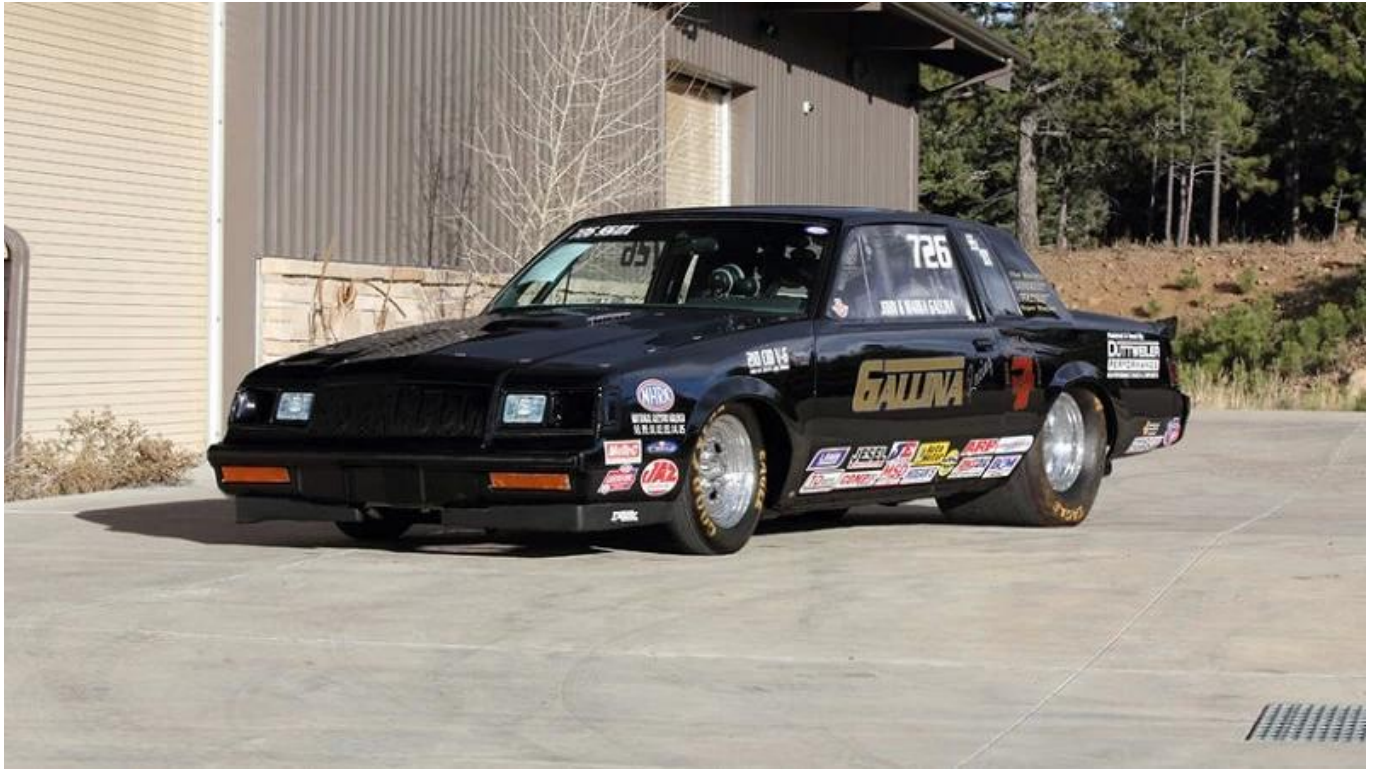
Note: Picture by Mecum Auction